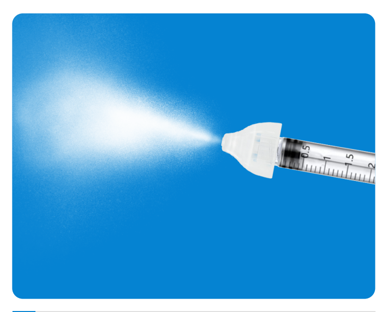
F/7, Tower A, No.77 North Aixihu Road, Nanchang High-Tech Industry Development Zone, Nanchang, Jiangxi 330096. China

F: +86-791 86861216 T: +86-791 86861216 W: www.kdlnc.com